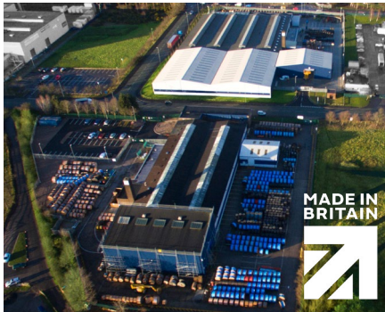
Tratos UK Ltd Factory in Knowsley, UK

Independent cable technology company Tratos UK has won a Queen's Award for Enterprise. The company collected the award for innovation from the UK's leading award for business for its technologically advanced JBA® compound.