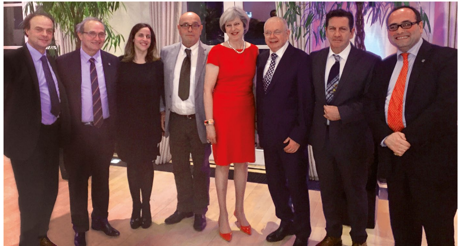
Tratos board members joined by former Prime Minister, The Rt Hon Theresa May MP

Tratos UK has the knowledge, experience and in-house R&D facilities to explore and create next-generation technology. Investment in innovation has positioned the company as a leading innovator within