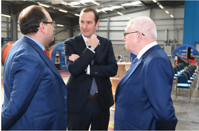
Members of Tratos Team