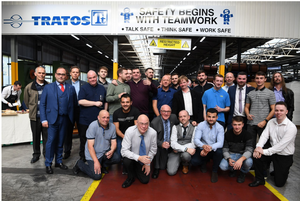
Tratos UK Ltd, Knowsley-Team