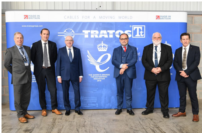
Members of Tratos Team