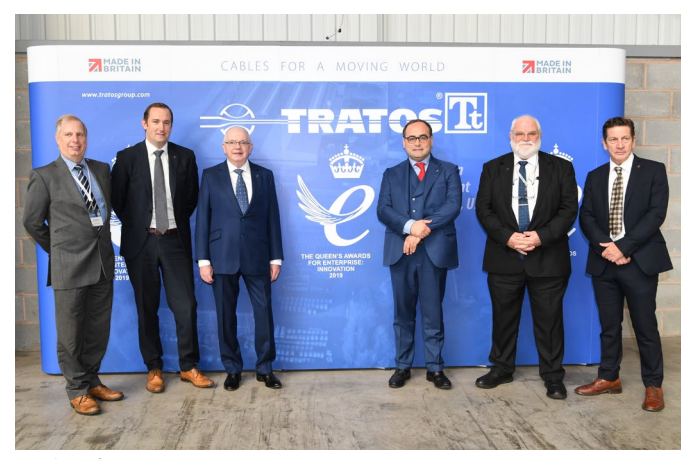
Members of Tratos Team