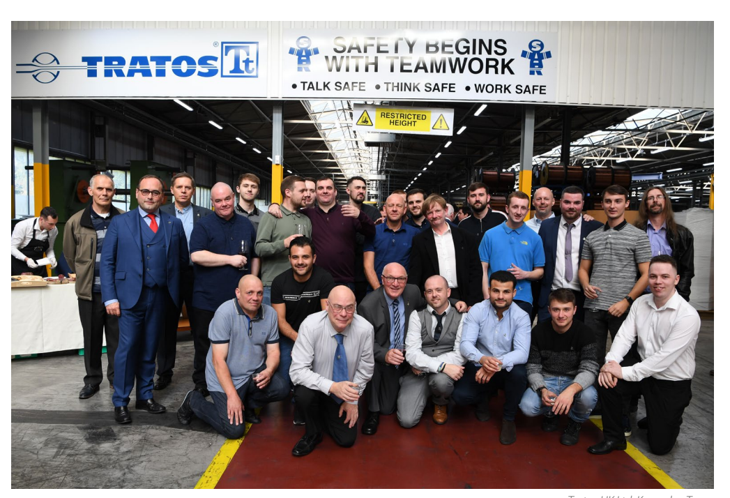
Tratos UK Ltd, Knowsley-Team